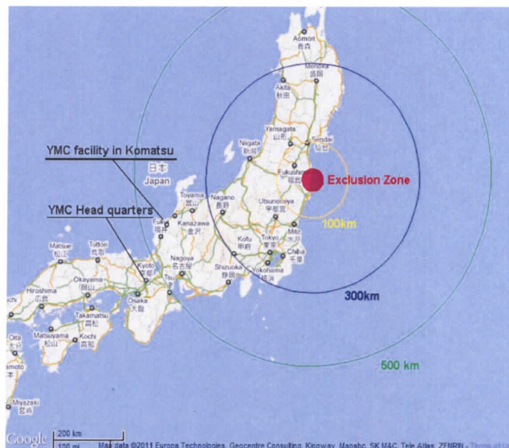
Figure 1: Location of YMC and Exclusion Zone (As of May 9, 2011)

The YMC Komatsu production facility and technical center are located in Komatsu city, Ishikawa Prefecture, located more than 400 km from the earthquake epicenter and the Fukushima Nuclear Power Plant. The Komatsu facility is conducting normal operations and the radiation level at Komatsu city is within normal level as measured by Japanese government.